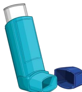
ANY MEDICATION YOUR CHILD NEEDS, WHICH MUST BE KEPT AT SCHOOL SUCH AS AN INHALER, ETC.

PLEASE REMEMBER TO LABEL EVERY ITEM OF CLOTHING AND EVERY BELONGING THAT YOUR CHILD TAKES TO SCHOOL. INCLUDE BOTH FIRST AND LAST NAME.