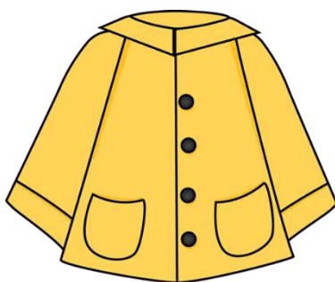
RAINCOAT/ WATERPROOF COAT