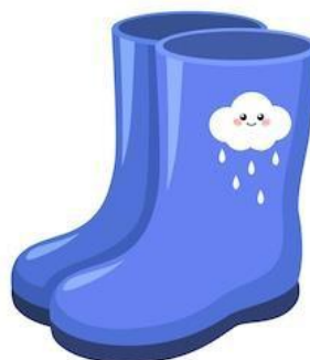
A PAIR OF WELLINGTON BOOTS